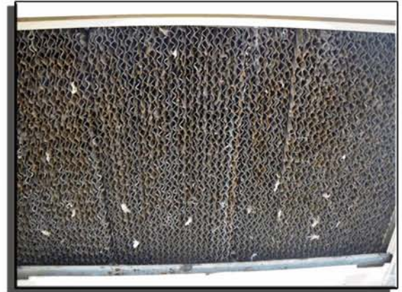
Cell Deck Without Cooler Guard

The problem of scale deposit build up is real. Time consuming clean up using acids and other harsh chemicals can be a hazard. But this can be prevented.